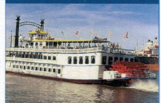
Enjoy a Riverboat Cruise

$100 Due Upon Signing. *Price per person, based on double occupancy. $1078 for single occupancy. Final Payment Due: 12/17/2024