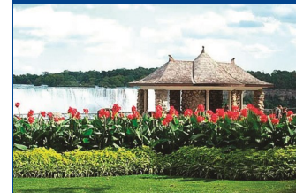
Visit beautiful Queen Victoria Park

$100 Due Upon Signing. *Price per person, based on double occupancy. $1869 for single occupancy. Final Payment Due: 6/23/2024