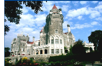
Magnificent Casa Loma Castle in Toronto