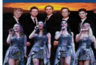
DUBLIN'S IRISH TENORS with special guests THE CELTIC LADIES