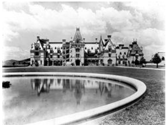
Biltmore Estate circa. 1900